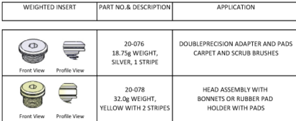
TABLE 1: ADJUSTABLE COUNTERWEIGHT APPLICATION TABLE